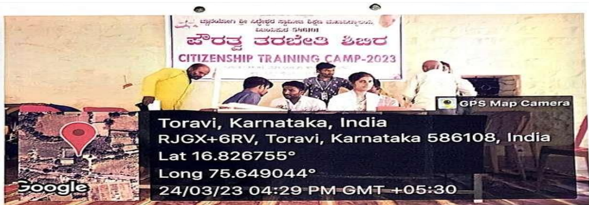
Medical Check Up - Eye free check up Camp.

The free eye check-up camp at Toravi was a significant step towards improving the eye health of the rural population. It highlighted the need for regular eye care and facilitated access to necessary treatments. The event successfully met its objectives, benefiting the community and contributing to the overall mission of BLDEA'S JSS College of Education, Vijayapur, in promoting health and education.