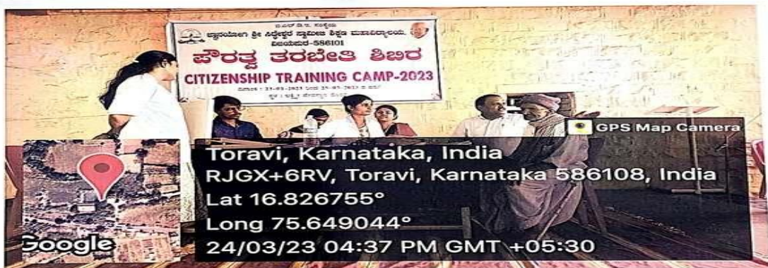
Free Check Up Camp of Eyes.