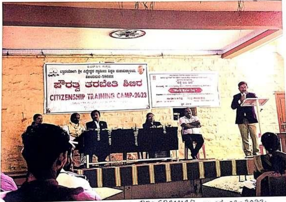
LEGAL AWARENESS PROGRAMME on 25-03-2023.