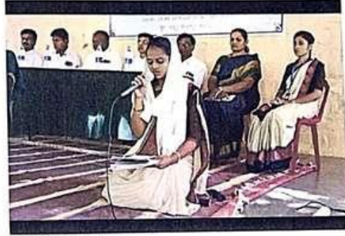
Programme on Meditation & Life Skills.